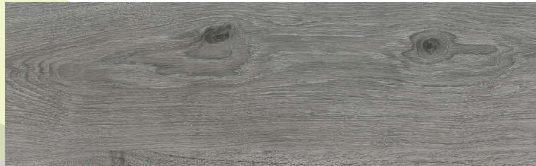
Tuscany Oak Mist

12 mil: TO001-203K / 22 mil: TO001-2555K