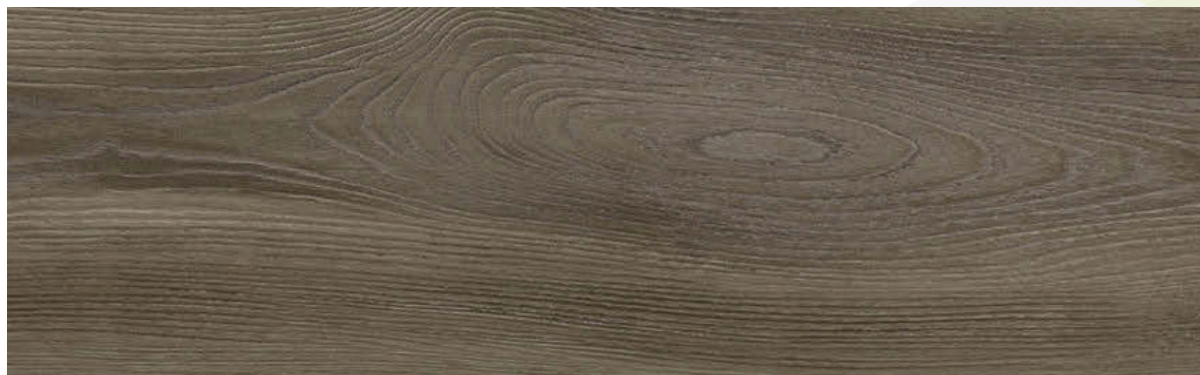
Alpine Oak Khaki

12 mil: AO005-203K / 22 mil: AO005-2555K