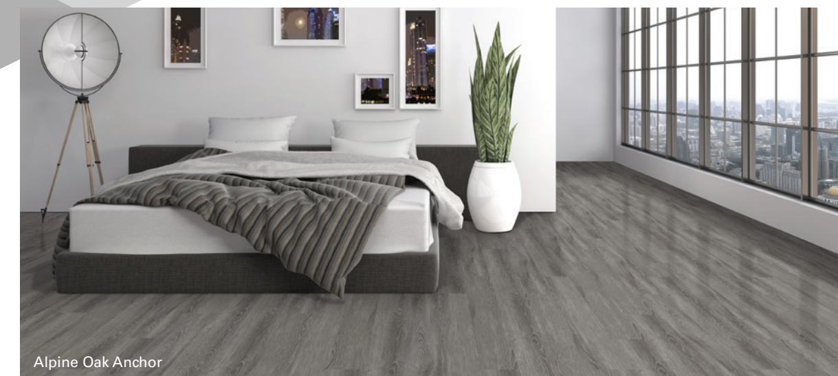
Alpine Oak Anchor

12 mil: BO003-203K / 22 mil: BO003-2555K