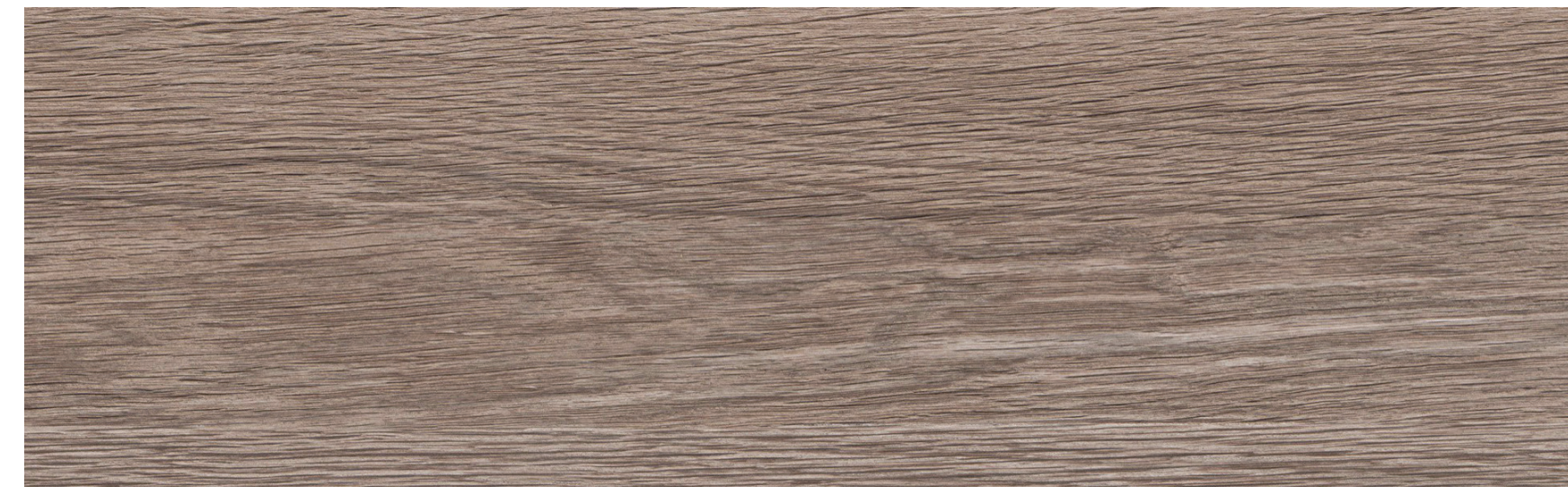
Peninsula Oak Plains

12 mil: PO002-203K / 22 mil: PO002-2555K