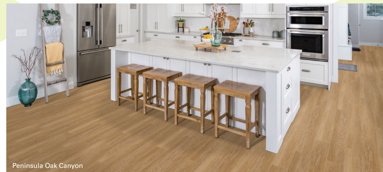
Peninsula Oak Canyon

12 mil: AO009-203K / 22 mil: AO009-2555K