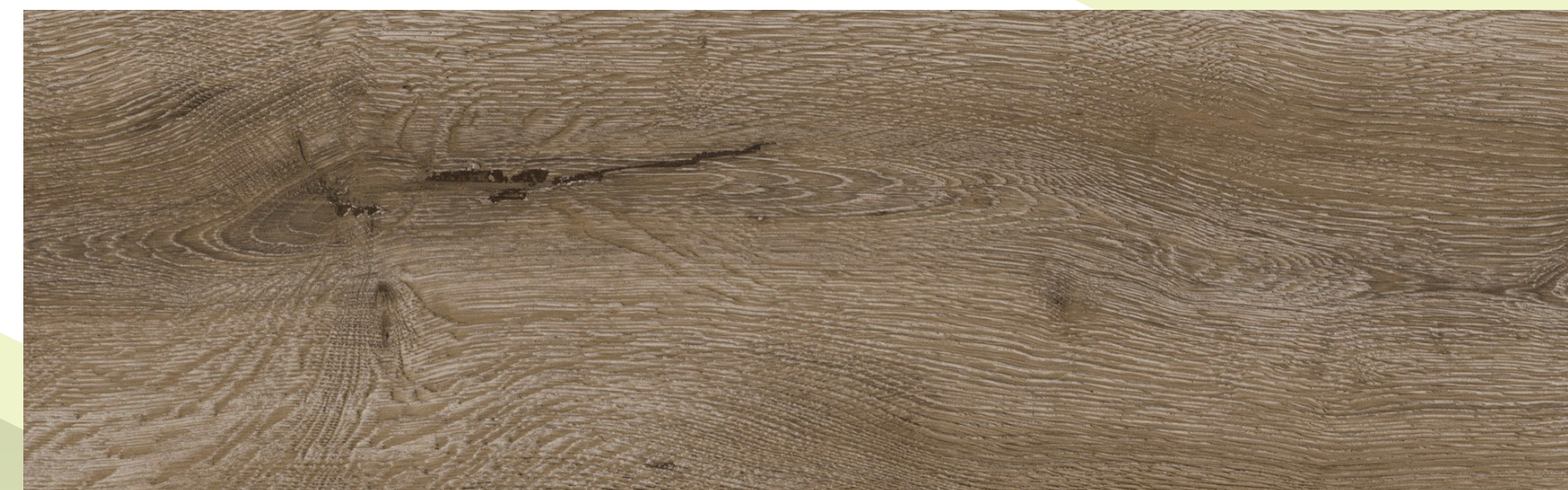
Tuscany Oak Peanut

12 mil: PO004-203K / 22 mil: PO004-2555K