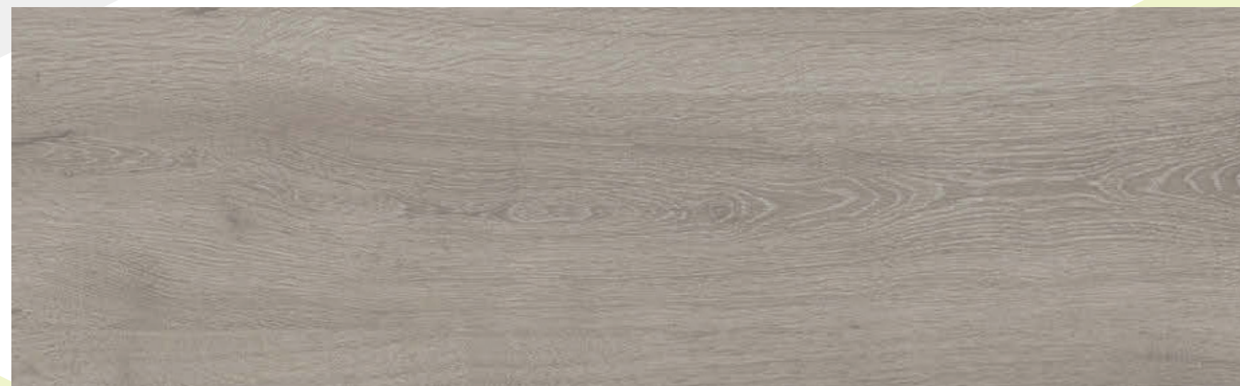
Tuscany Oak Snow

12 mil: TO001-203K / 22 mil: TO001-2555K