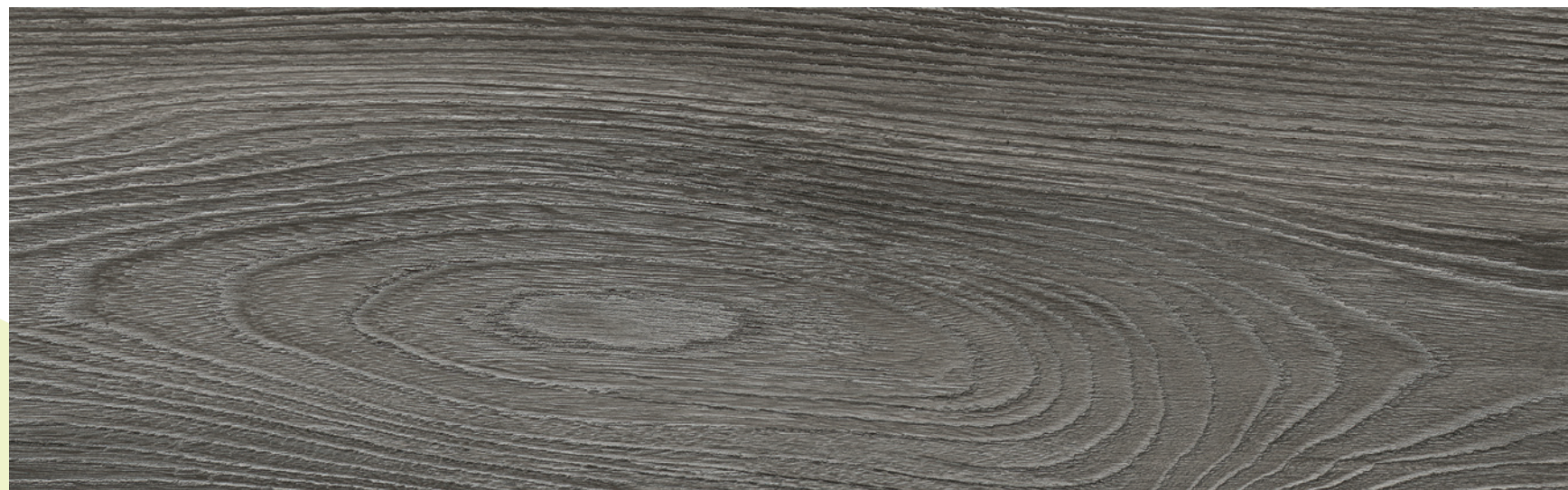
Alpine Oak Anchor

12 mil: AO005-203K / 22 mil: AO005-2555K