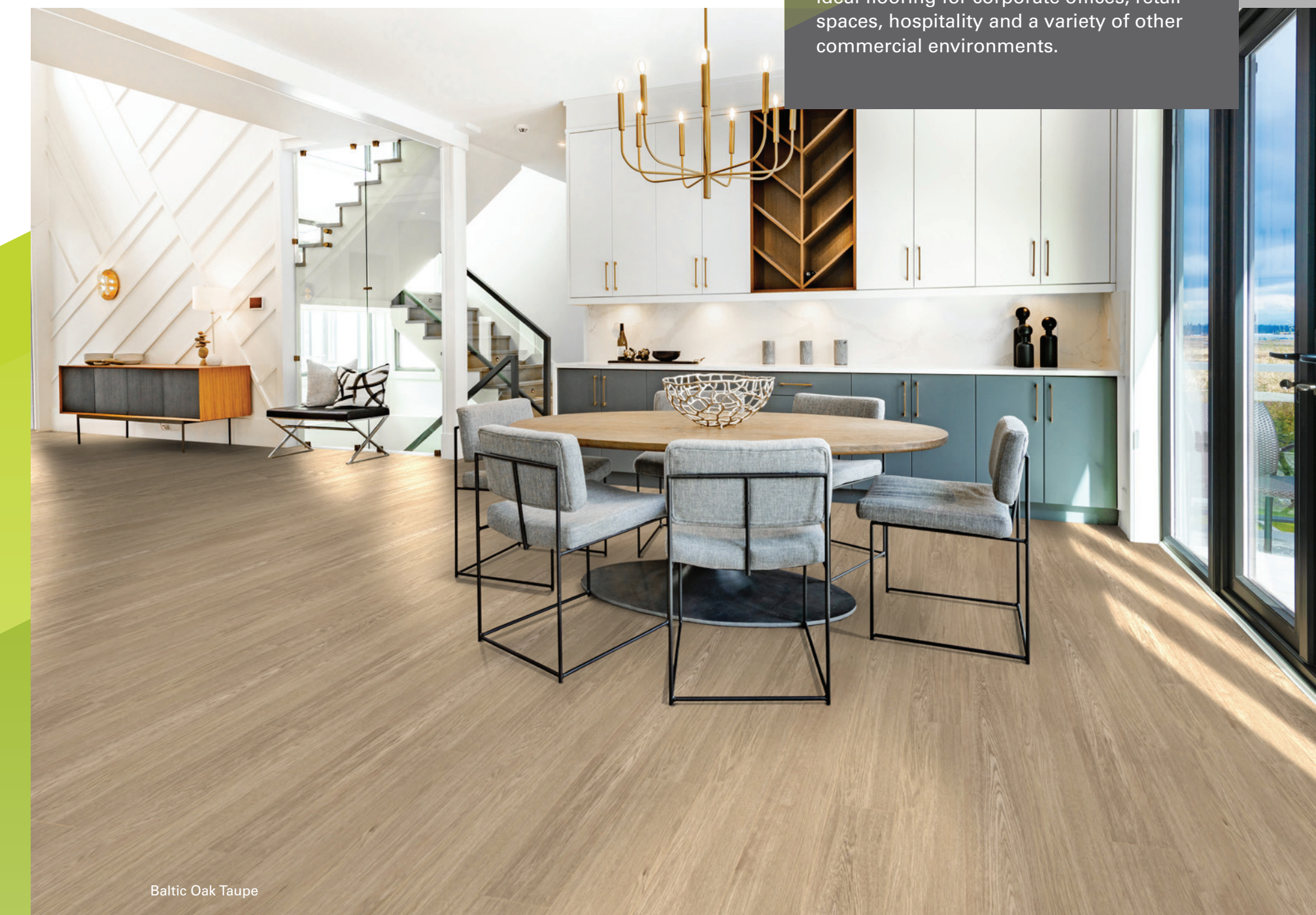
Baltic Oak Taupe

With 10 popular wood looks and realistic embossed surface, AVA® RYSE™ provides superior beauty and performance in 6" x 48" glue-down planks with a straight edge.