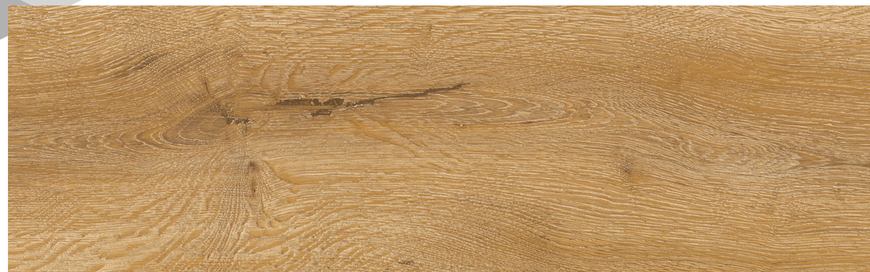
Tuscany Oak Medallion

12 mil: TO002-203K / 22 mil: TO002-2555K