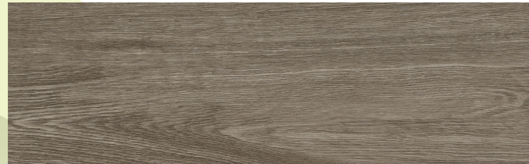
Baltic Oak Suede

12 mil: BO002-203K / 22 mil: BO002-2555K