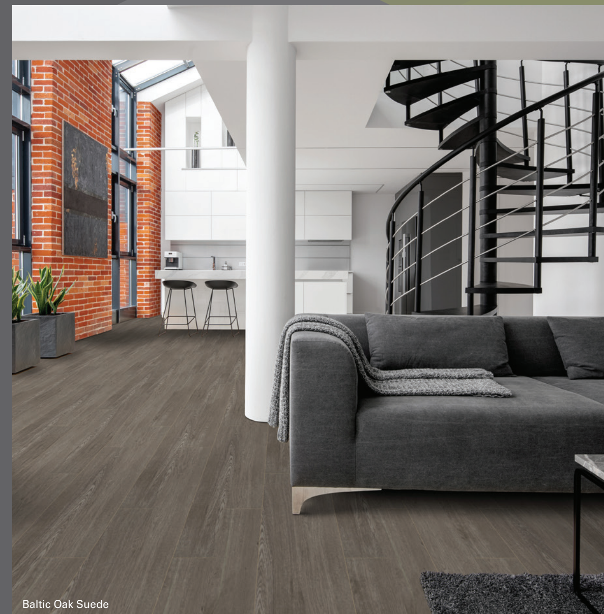
Baltic Oak Suede

avafloor.com • 877.861.5292 sales@avafloor.com