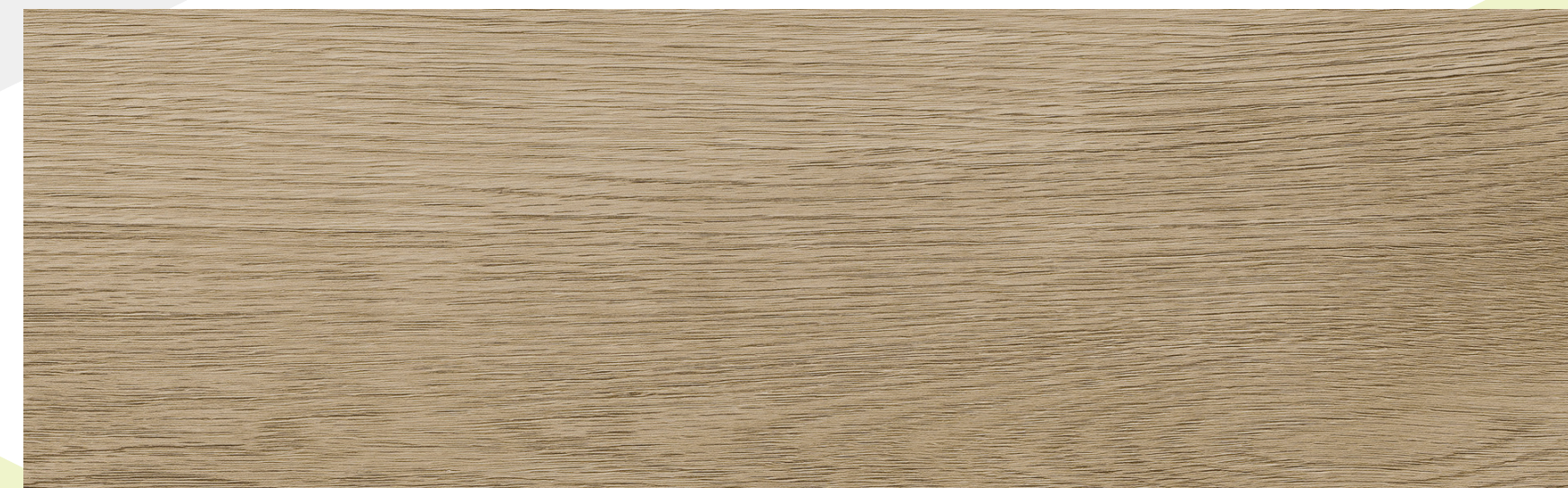
Baltic Oak Taupe

12 mil: TO008-203K / 22 mil: TO008-2555K